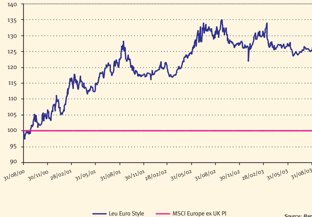
Outperformance of the Bank Leu 'style invest' equity product over the last three years