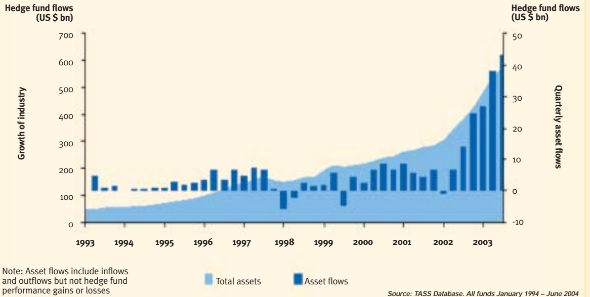
Growth of the CSFB/Tremont Hedge Fund Index