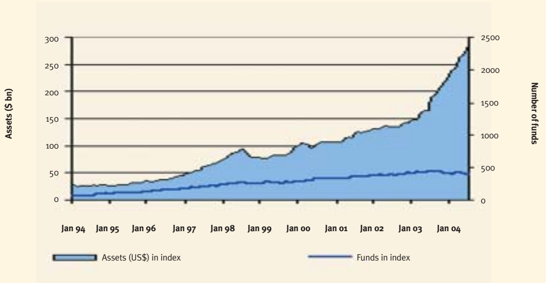
The CSFB/Tremont Hedge Fund Index

The CSFB/Tremont Hedge Fund Index has a diverse investment universe comprising some US$300 bn in assets